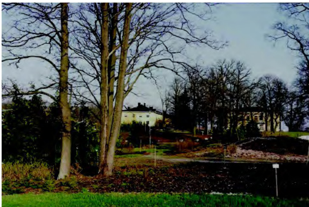
Kumpula Botanic Garden of Helsinki University in early spring 2001. Kumpula manor was the second home of Forsskål's childhood family. The old buildings have long since disappeared but the undulating terrain must have been similar in Forsskål's time. The main building, just visible on the right behind the trees, stands on the same site as the original one.

skips the stay in Jeddah altogether. Later on, in December, he writes to the Danish envoy in Constantinople expressing his wish to turn homewards as soon as possible. He had grown weary of the long distances and postal delays.